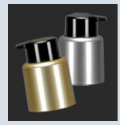
Metal Shell Option